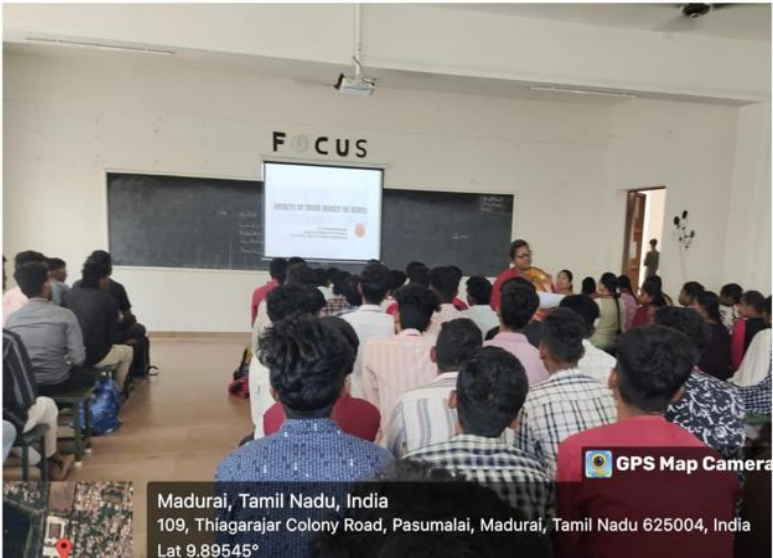
Madurai, Tamil Nadu, India 109, Thiagarajar Colony Road, Pasumalai, Madurai, Tamil Nadu 625004, India Lat 9.89545°