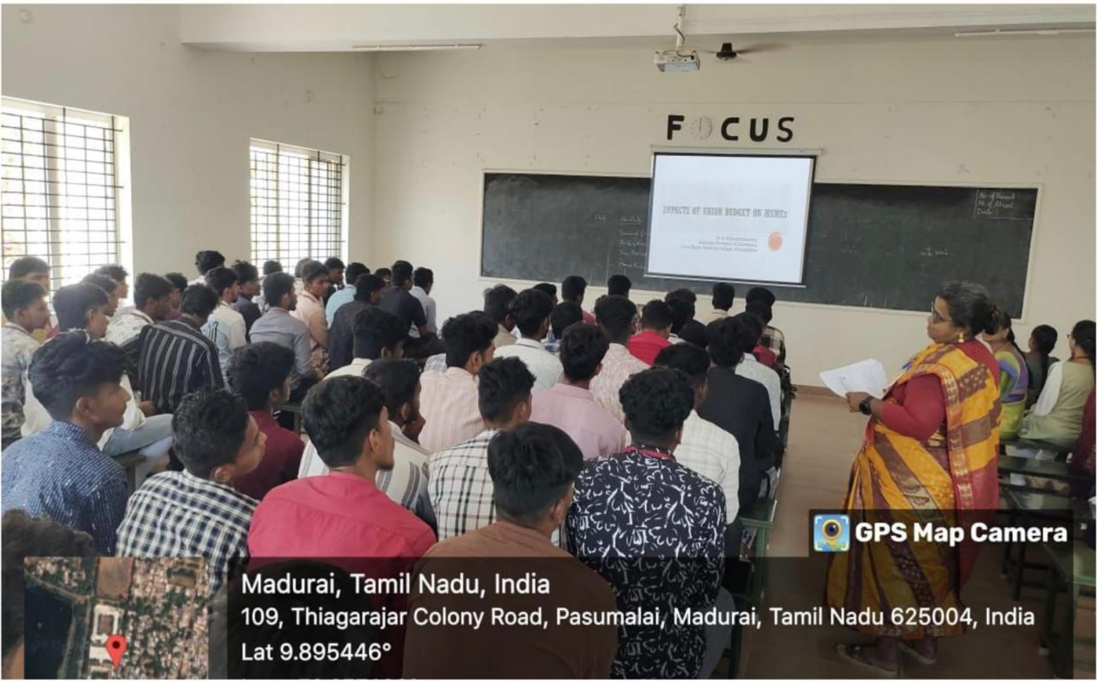
Madurai, Tamil Nadu, India 109, Thiagarajar Colony Road, Pasumalai, Madurai, Tamil Nadu 625004, India Lat 9.895446°