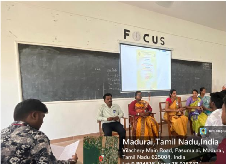
Madurai, Tamil Nadu, India Vilachery Main Road, Pasumalai, Madurai, Tamil Nadu 625004, India Lat 9.894818° Long 78.076747°